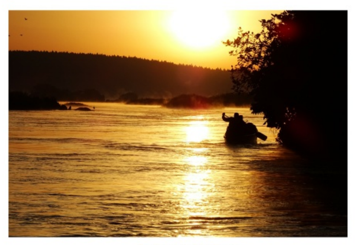
Terms and conditions

* Valid for a minimum 2 night stay * Valid year round * Bride enjoys a 50% discount on every night's stay * Private poolside dinner (weather permitting) * Sparkling wine with dinner *Honeymoon style daily room turndown *Honeymoon Special is a stand alone special and not combinable